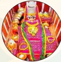
Hanuman ji, Prayagraj