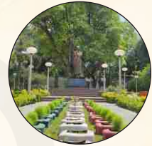
Azad Park, Prayagraj